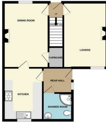
1ST FLOOR 559 sq.ft. (51.9 sq.m.) approx.